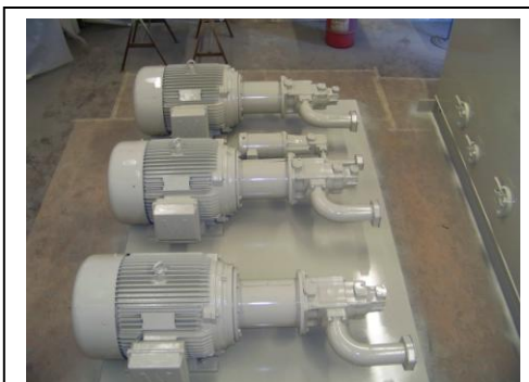
Motors, adapters, and pumps are mounted on a separate skid for easy handling.

Related Products Available: Seed Scales, Self-checking Bale Scales, & Seed Blowers.